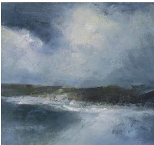
6. ADRIFT pastel 32cm x 32cm