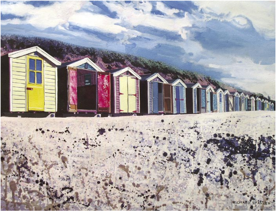
15. SIZZLING HOT DAY, SAUNTUN BEACH HUTS oil on paper 46cm x 60cm