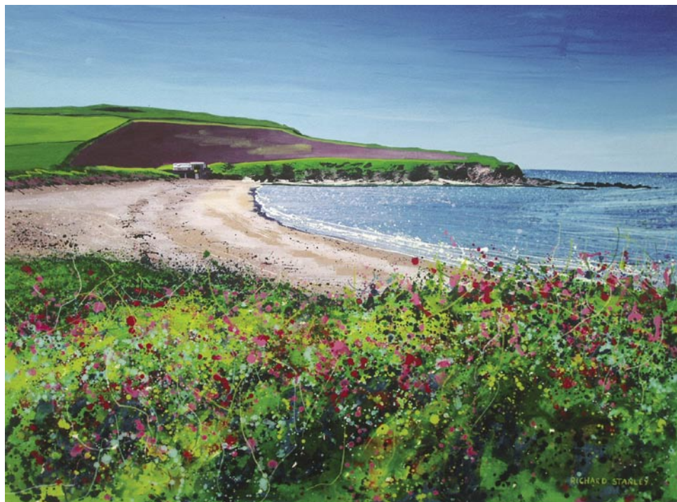
12. AMONG THE FOXGLOVES, PINK CAMPION AND SUNSHINE, BANTHAM mixed media on paper 54cm x 73cm