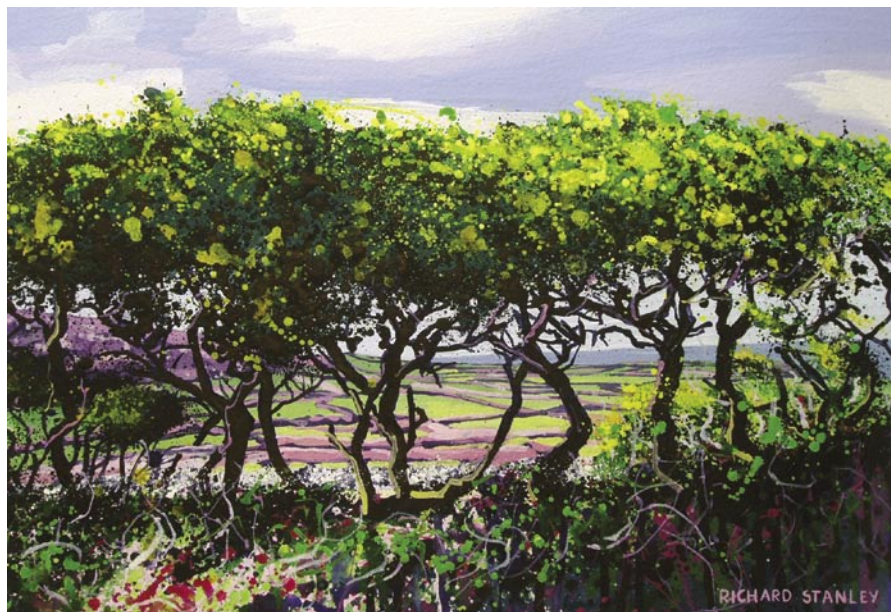
13. CORNISH GORSE HEDGE oil on paper 30cm x 44cm