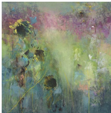
2. ABBEY GARDEN, TRESCO pastel 48cm x 48cm