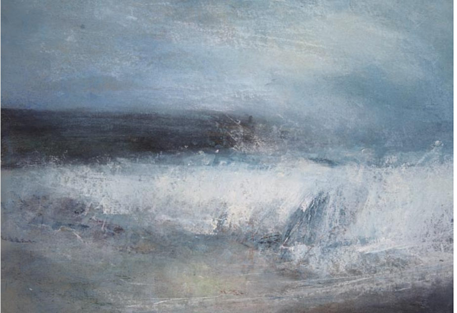
8. PORTHMEOR SURF pastel 31cm x 41cm