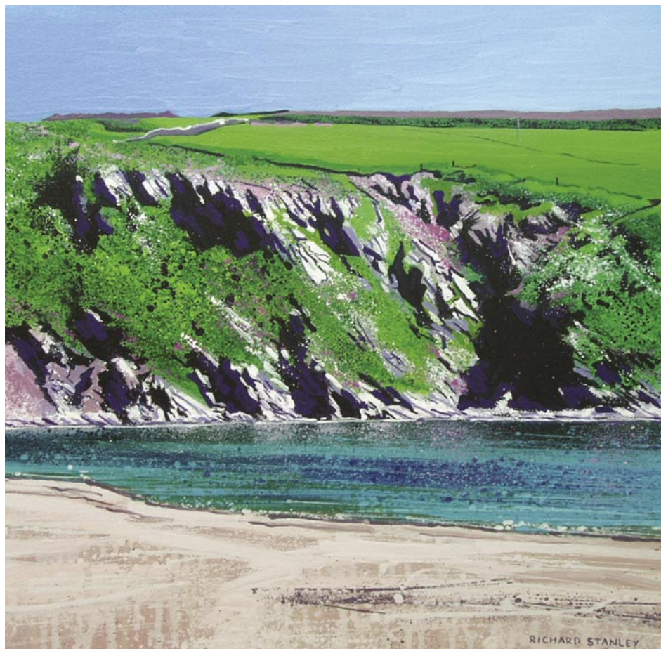
21. BANTHAM CLIFFS oil on paper 47cm x 47cm