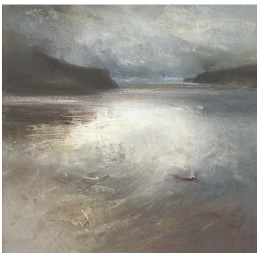
7. WINTER LIGHT, ERME ESTUARY pastel 32cm x 32cm