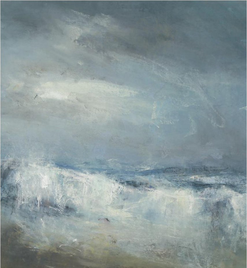
4. SEVENTH WAVE pastel 60cm x 55cm