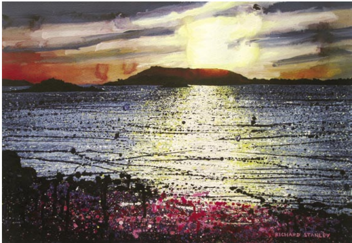
19. BLUE SKY, START POINT LIGHTHOUSE oil on paper 32cm x 43cm