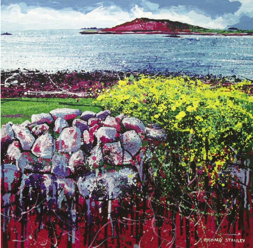
14. SUNLIGHT ON THE WATER, TOWARDS BRYHER FROM TRESCO oil on paper 50cm x 52cm