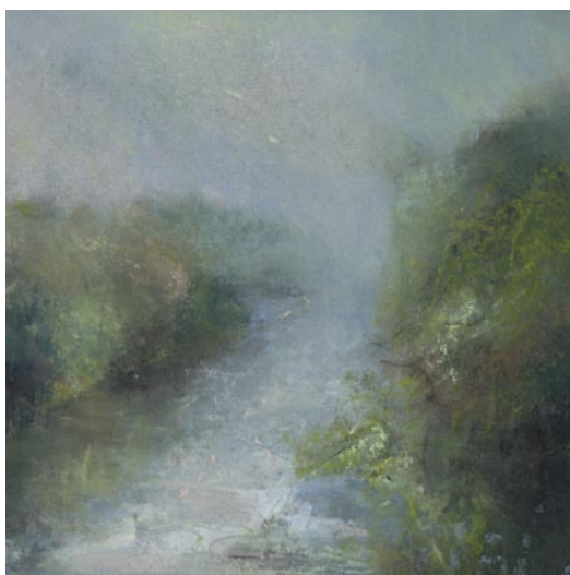
9. RIVER SONGS I pastel 25cm x 25cm