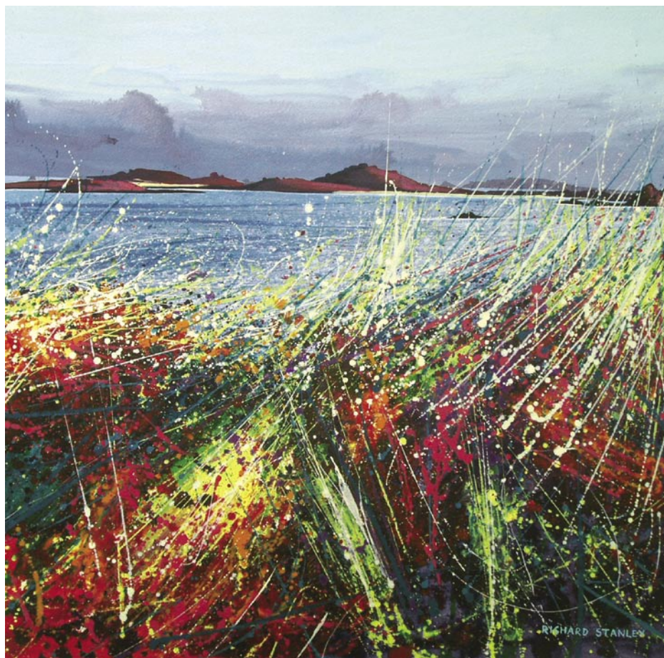
22. EVENING LIGHT, RUSHY PORTH, TOWARDS ST MARTINS mixed media on paper 55cm x 56cm