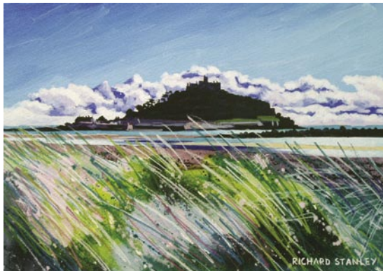
17. DEVON GORSE, BIRDS TWITTER mixed media on paper 32cm x 32cm