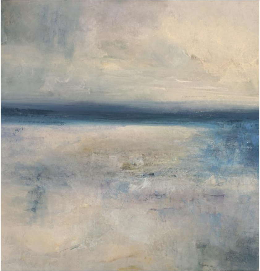
11. IN BETWEEN pastel 60cm x 55cm