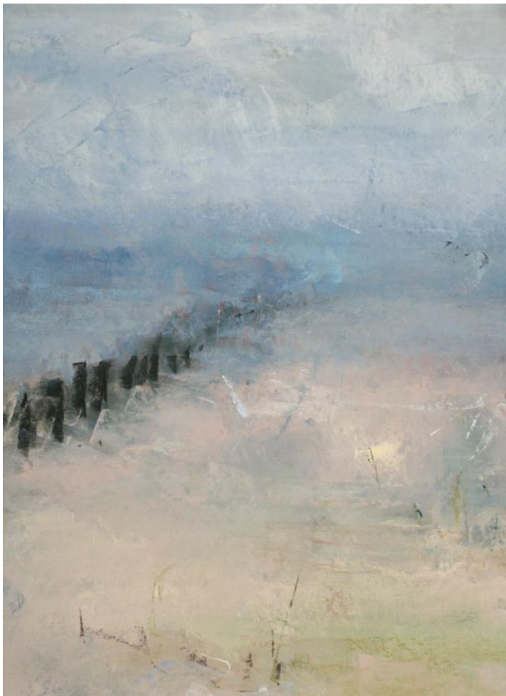
5. MORNING AND BIRDS pastel 52cm x 40cm