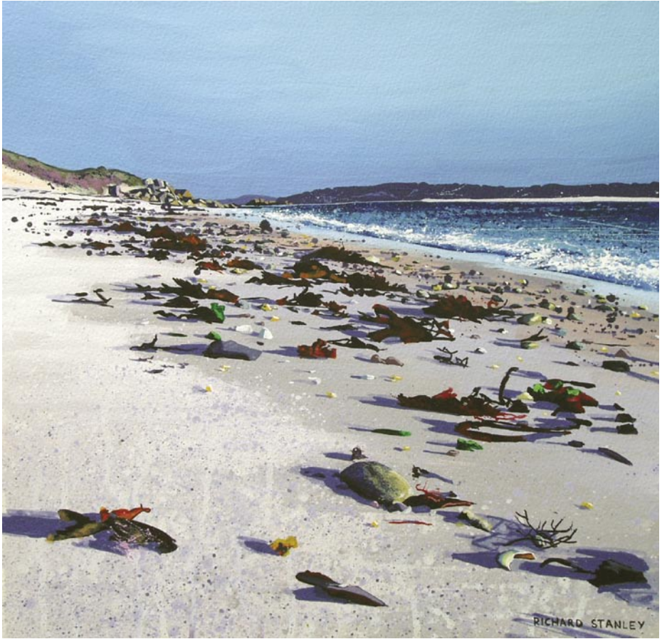
16. WALKING UP THE TRESKO TIDELINE mixed media on paper 43cm x 45cm