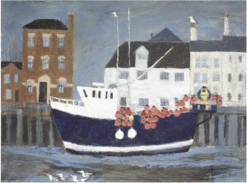
19. FISHING BOAT AT LOW TIDE, WEYMOUTH Acrylic and pencil 30 x 40cms