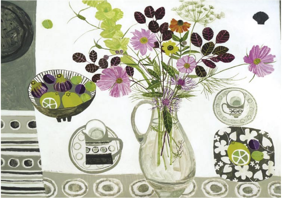
3. GARDEN FLOWERS Oil on card 65 x 81cms