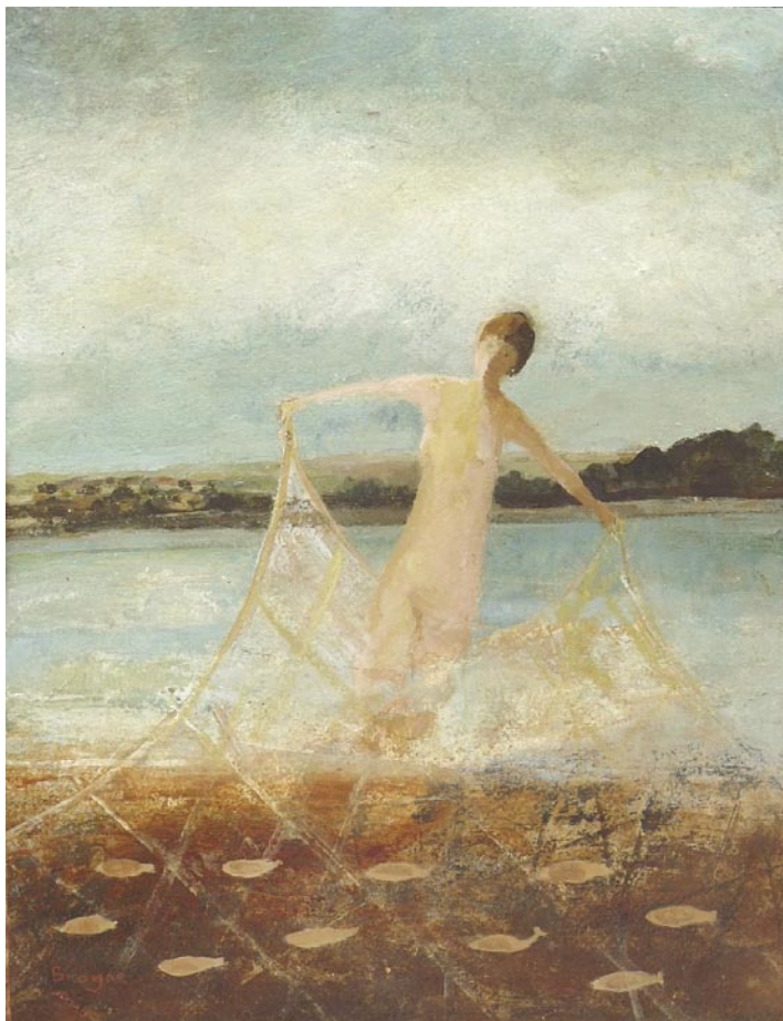
8. WIDE NET II

Watercolour and pigment on paper 47 x 35cms