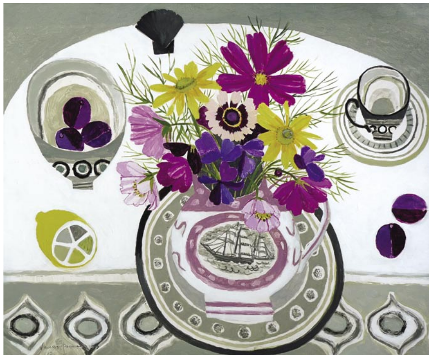
1. SWEETPEAS, PINK COSMOS Oil on card 39 x 46cms