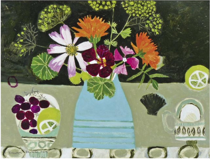
2. BLACK NASTURTIUMS AND GRAPES Oil on board 24 x 31cms