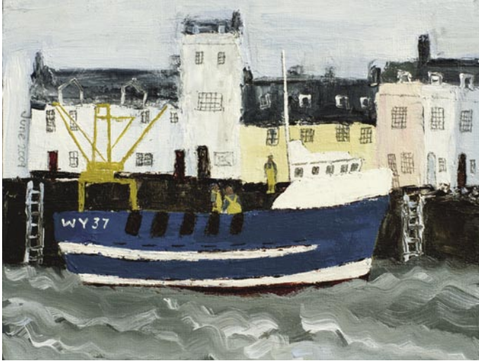
18. FISHERMEN AT HARBOURSIDE Acrylic and pencil 15 x 20cms