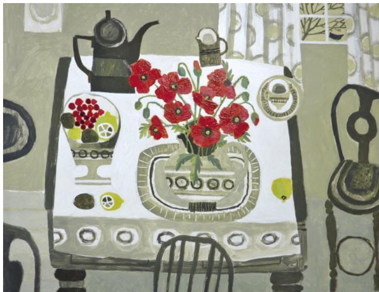
5. POPPIES ON THE TABLE Oil on card 25 x 31cms