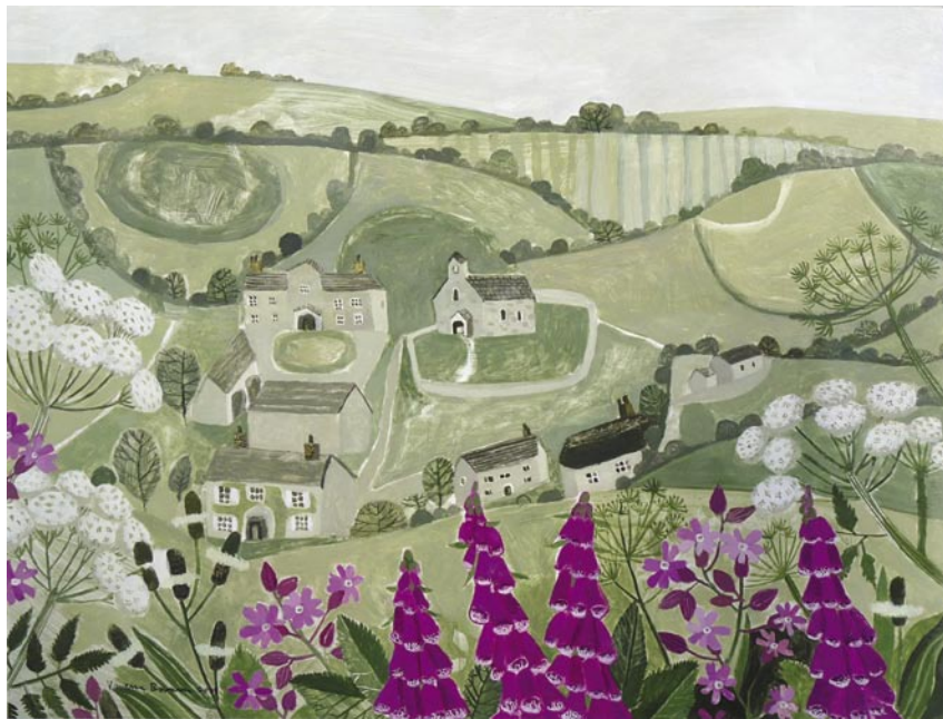
7. TOLLER FRATRUM AND FOXGLOVES Oil on card 25 x 31cms