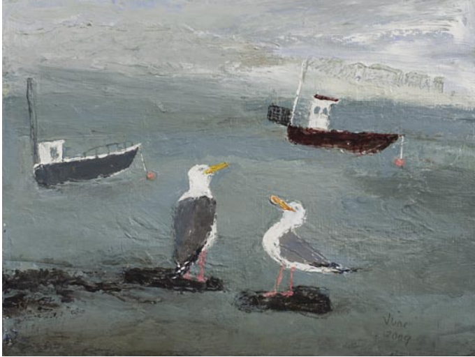
20. RISING TIDE, SWANAGE Acrylic and pencil 15 x 20cms