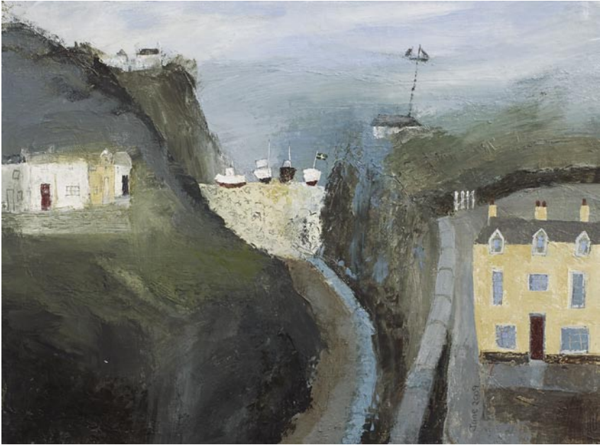
17. SEA HILL, BEER Acrylic and pencil 30 x 40cms