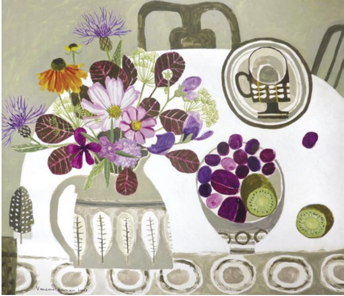
4. COSMOS AND KIWIS Oil on card 35 x 40cms