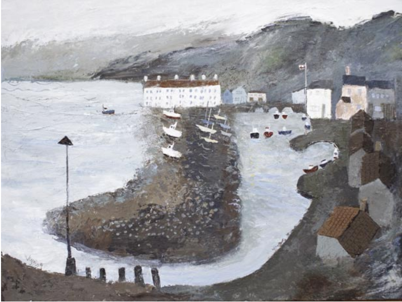
16. AXEMOUTH, EAST DEVON Acrylic and pencil 30 x 40cms