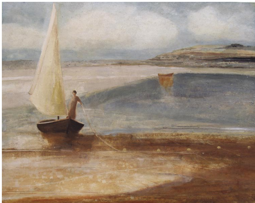
14. THE WHITE SAIL Watercolour and pigment on canvas 80 x 100cms