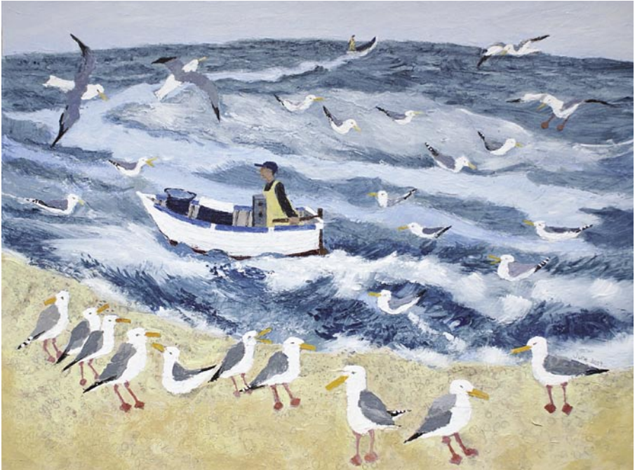
21. EXCITEMENT FOR GULLS Acrylic and pencil 45 x 60cms