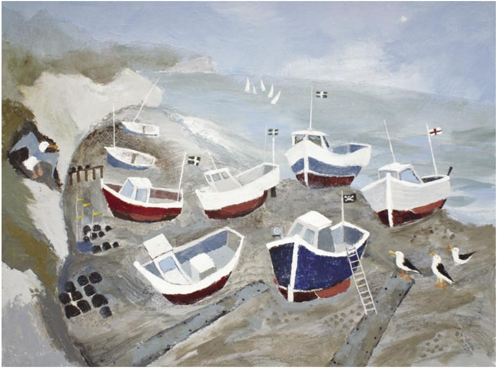
15. BEER BEACH, EAST DEVON Acrylic and pencil 45 x 60cms