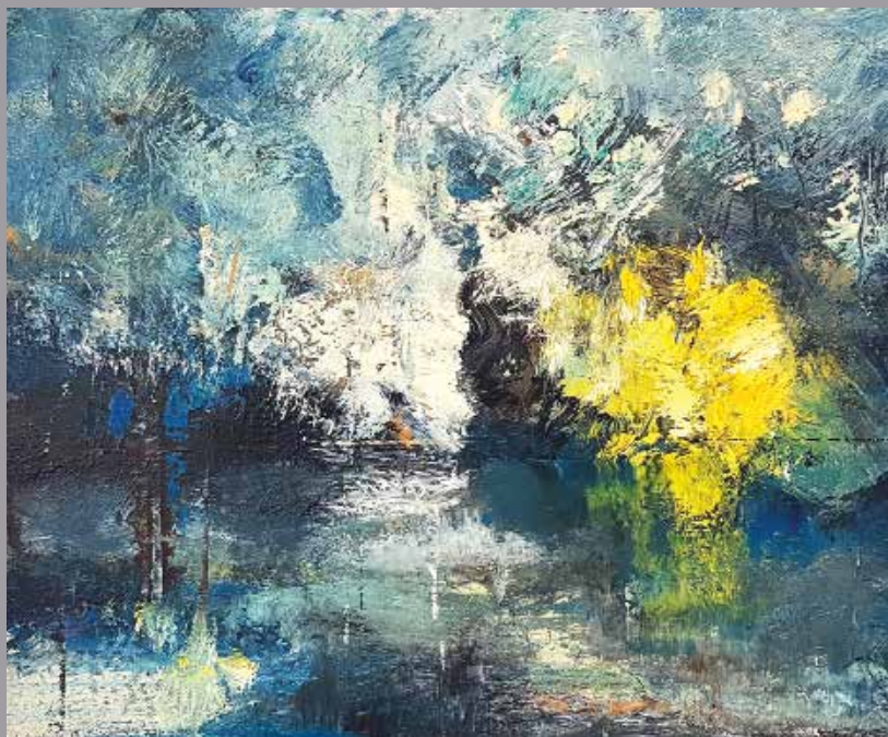
22 River Exe oil & acrylic on board 40 x 50cms