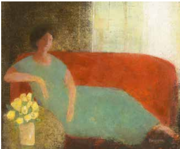
The Red Sofa Pigment & acrylic 27 x 33cms £1400