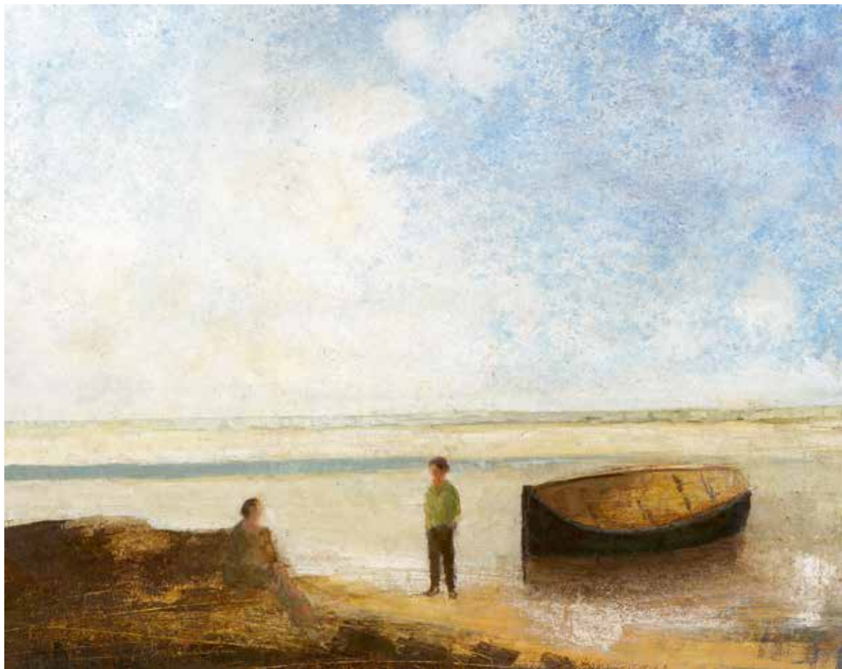
On the Low Shore Pigment & acrylic 50 x 60cms £2500