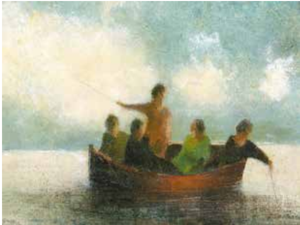
Night Fishing Pigment & acrylic 19 x 25cms £980