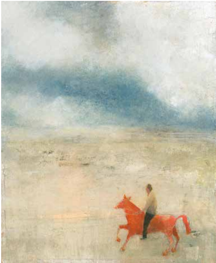
Red Horse Pigment & acrylic 60 x 52cms £2500