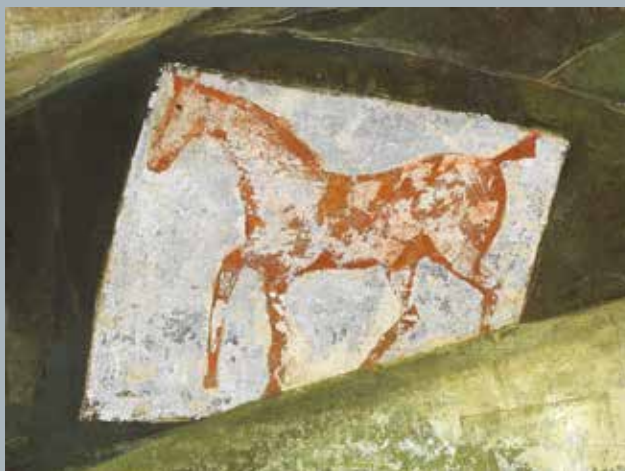
Chalk Hill Pigment, silver leaf & acrylic 23 x 30cms £1100