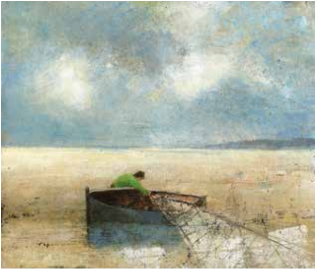
Morning Tide Pigment & acrylic 26 x 32cms £1400