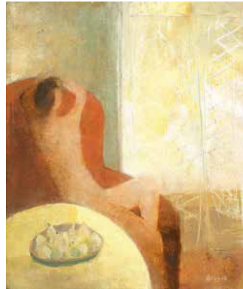
Dish of Pears Pigment & acrylic 28 x 23cms £1150