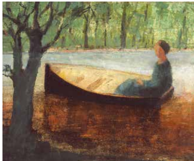
Quick Water Pigment & acrylic 28 x 33cms £1400