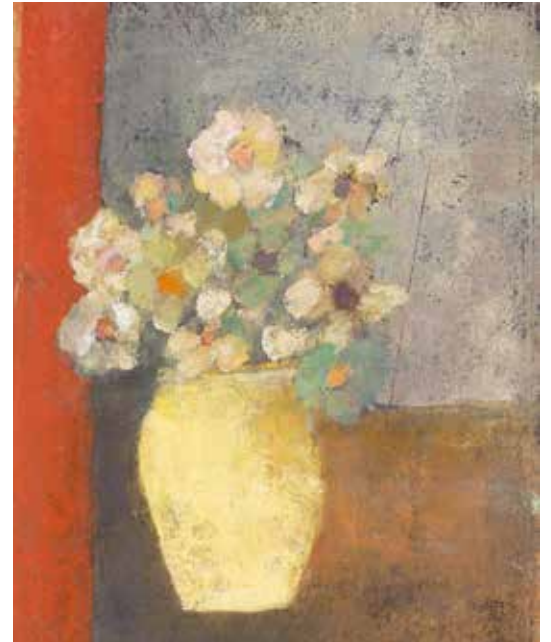
Garden Flowers Pigment & acrylic 30 x 23cms £1150