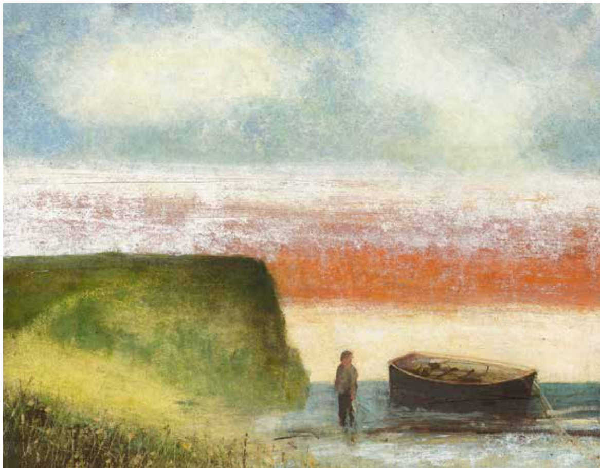
Sea Reach Pigment & acrylic 50 x 60cms £2500