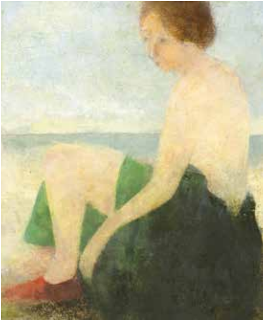
The Bather Pigment & acrylic 33 x 27cms £1400