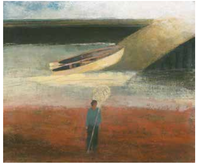
Shrimp Net Pigment & acrylic 35 x 40cms £1700