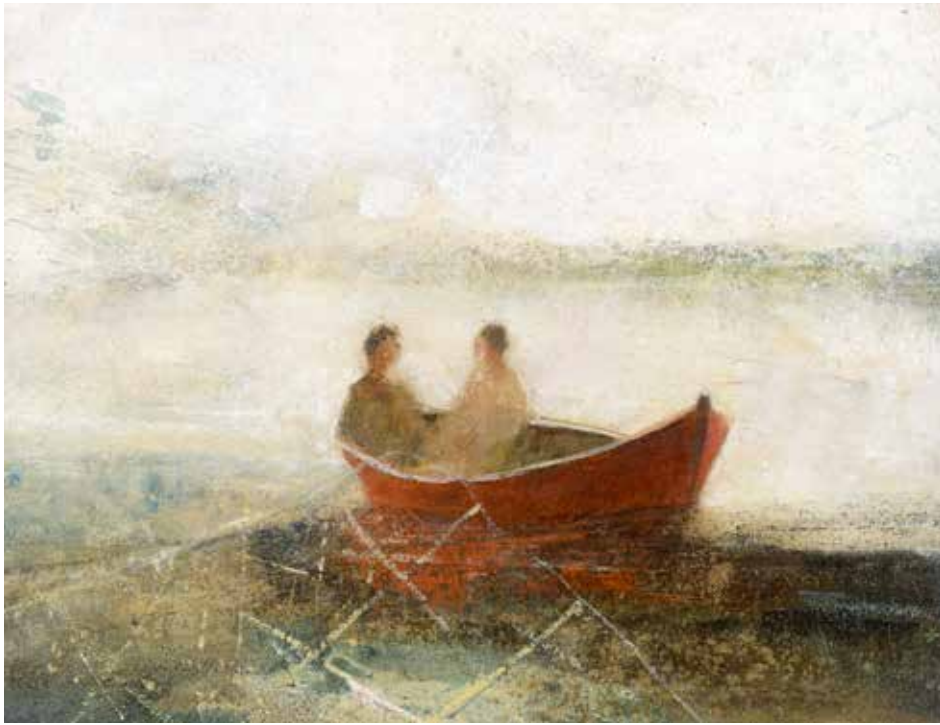
Unstained Light Pigment & acrylic 35 x 45cms £1800